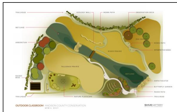
Assistance for new Winterset Outdoor Classroom through seed purchase and wetland construction.

Additional terrariums, lights, plants, filters and aquarium supplies for the Nature Center live animal exhibits.