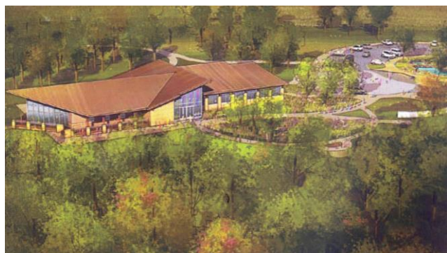
Development of interactive interpretive exhibits for new Madison County Conservation Center